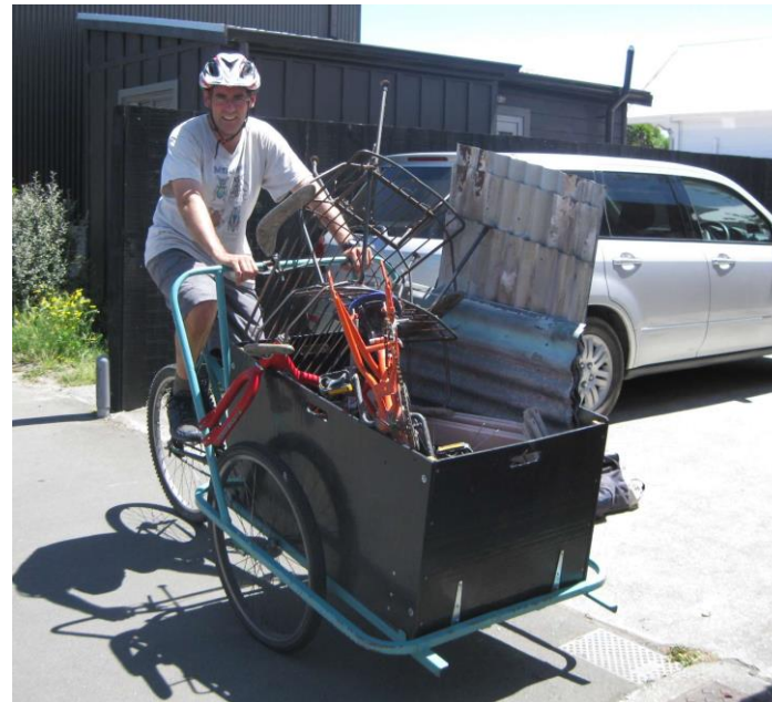
Tadpole 3 wheel cargo bike

The 2 wheeled Bakfiets is great fun to ride and great for conversing with kids. The 3 wheel tadpole is good for serious loads and has 20mm-hub, downhill mtb wheels on the front for strength & internal gear hub with coaster brake on back. 1200 x 700 mm load space.