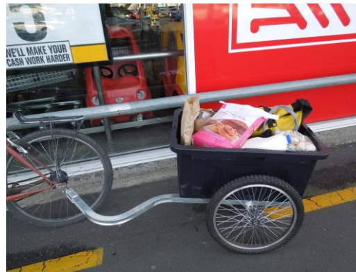
Light-weight trailer with 100 litre Bin