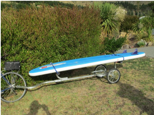
SUP Stand-up Paddleboard trolley 10.5' board