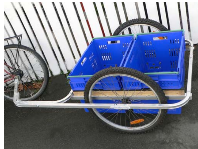
Large trailer with 24" wheels and two 600x400mm 75 litre RE-crates from Stowers.

A wooden trailer kitset is also available where you construct a wooden frame and the kitset provides instructions, a bolt on towbar, wheel dropouts and the hitch.