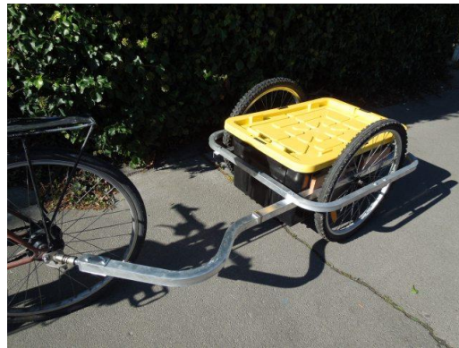
Heavy duty trailer with 100 litre bin

email steve@cycletrailers.co.nz or ph 0210619296 with your details and arrange a bank account transfer. Please make cheques out to Steven Muir.