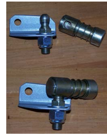
Quick release ball joint hitch and base