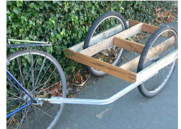
Wooden trailer kitset