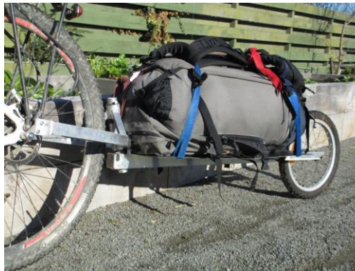
Single wheel trailer for touring