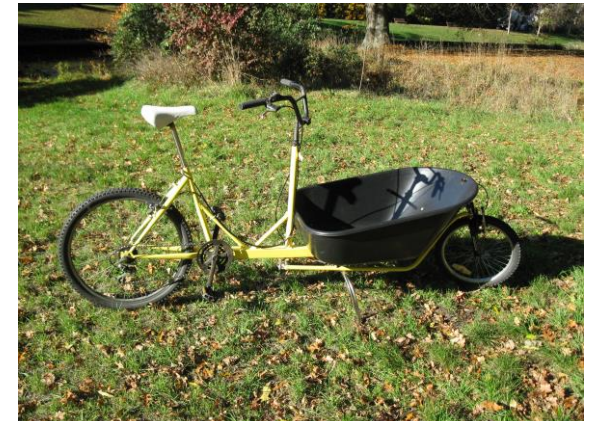
Bakfiets Dutch cargo bike