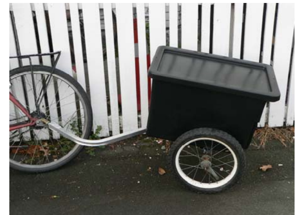
Small trailer with 16" wheels and 68 litre eco-bin from Stowers made from fully recycled plastic with waterproof lid.